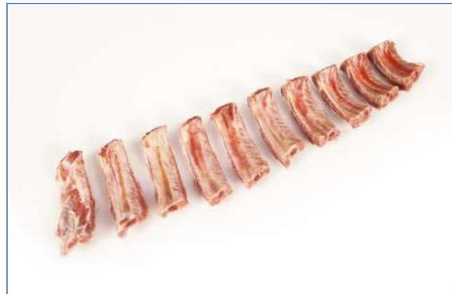
5 Spare Ribs – loin, individual.