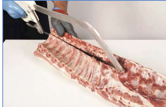
2 The ribs are sawn through at a point where they join the vertebrae.