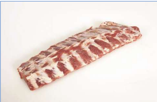
4 Cut between the ribs to create individual spare ribs.