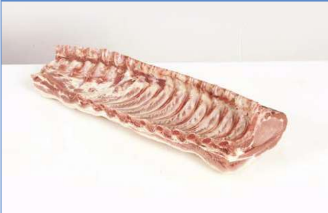
1 Loin of pork.